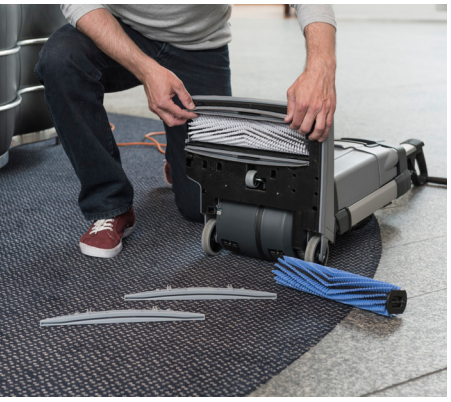
Apart from getting faster cleaning of hard floors, you will also be able to freshen up smaller carpets, including removal of spots, by adding an optional carpet kit. Brush and squeegees can be removed without any tool making daily maintance operations easy and fast

The SC100 clean in a position height of just 25 cm