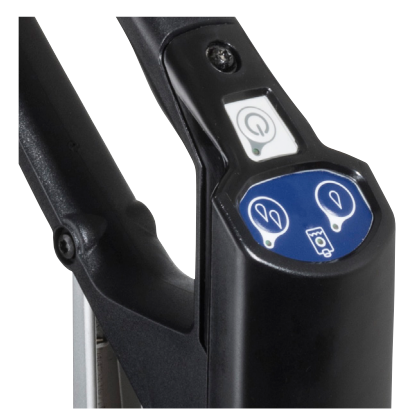
You will remain in full control of the scrubber dryer thanks to the intuitive touch display with two water settings and a solution indicator, alerting you if the tank is empty