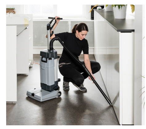
The optional manual suction hose is ideal for cleaning any unreachable area or spot cleaning.